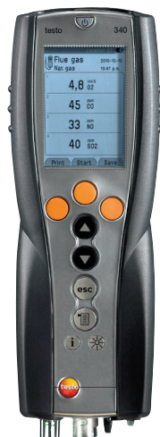
testo 340 4-Gas Emissions Analyzer