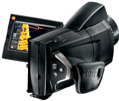
testo 890 High End Thermal Imager