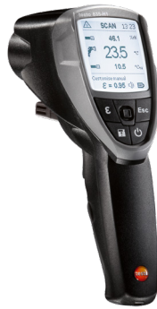
testo 835-H1 IR Thermometer with Humidity